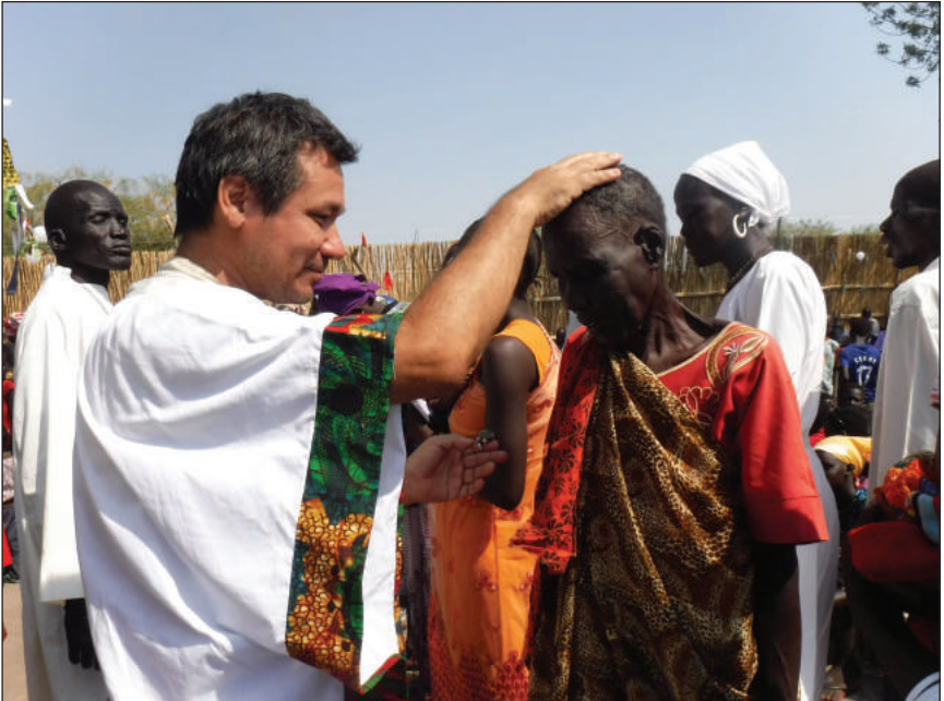
Baptism in Pakan.

South Sudan is in the news only because there is a civil war and the tacit assumption is that there will be peace in the country when this conflict ends.