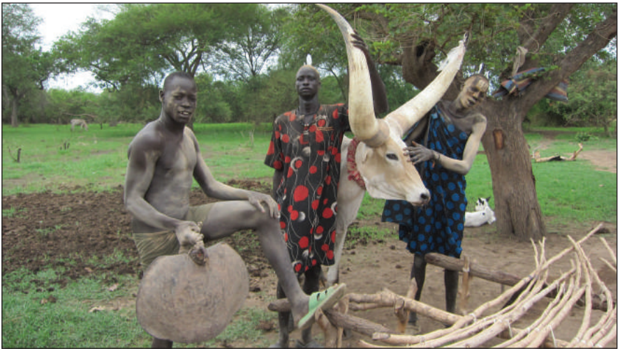
Mundari pastoralists with their cow.

Additionally, the people in rural regions have hardly diversified activities, apart from the separation of the two sexes. A Nuer (and Dinka) man is at the same time a shepherd, fisherman, farmer, architect, trader, soldier and blood avenger. Every pastoralist has one or two semi-automatic rifles (AK-47). The local culture cannot distinguish between civilians and fighters, at least not among men. Furthermore, it knows childhood only until the beginning of puberty. From then on, a boy learns to hunt, shoot and kill. The modern political definition of adulthood from the age of 18 is incomprehensible in traditional culture – quite apart from the fact that many do not even know their birth year – and therefore, the problem of child soldiers, which is causing so much attention in the West, is difficult to communicate.