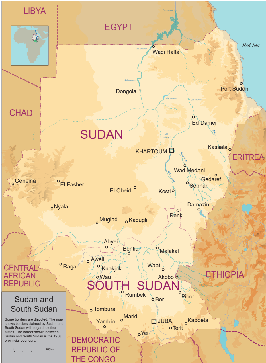
Front cover photograph: Temporary settlement along the Pow river, Bahr-el-Zeraf.