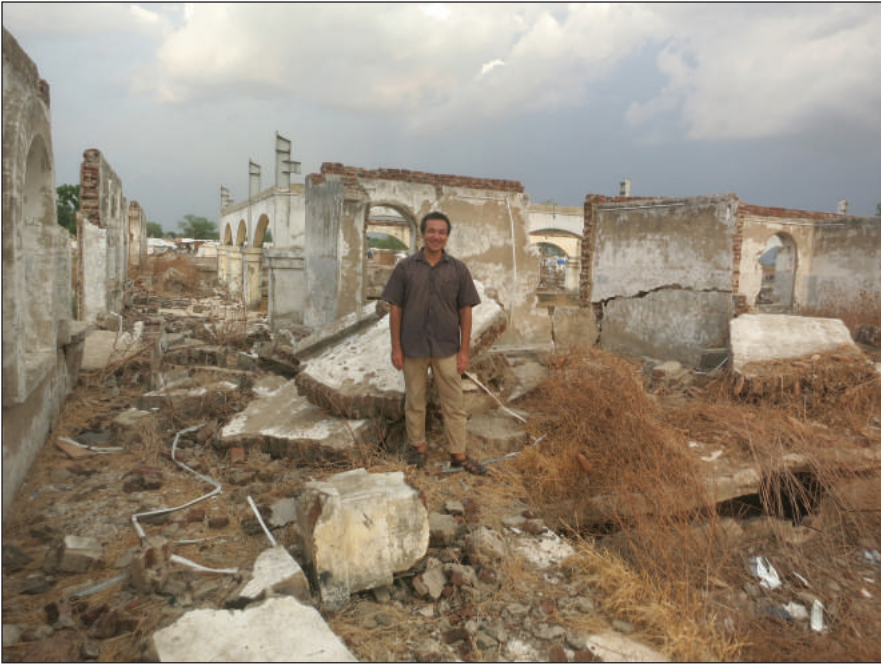
School building destroyed in New Fangak in December 2014.

and distributive justice. There is an African proverb: 'I am because we are'. These are the immediate relationships that carry you. In the West, relationships and friendships are optional. Contact can be cut off even with parents and siblings because it is possible to take care of oneself in the modern state. A Nuer or Dinka, on the other hand, cannot rely on anything, except that his brothers and sons will risk their lives in his defence and in old age, only the extended family will provide for him. Therefore, there is 100% loyalty to a close relative, whether he is right or wrong. Furthermore, one's own clan is uncompromisingly defended against others; for these reasons I would argue that the civil war is ethnic. The clan and tribal collective almost completely overshadows the identity of the individual and because the identity of a person is embedded in his or her collective, the 'other' is almost always perceived only as a representative of his collective.