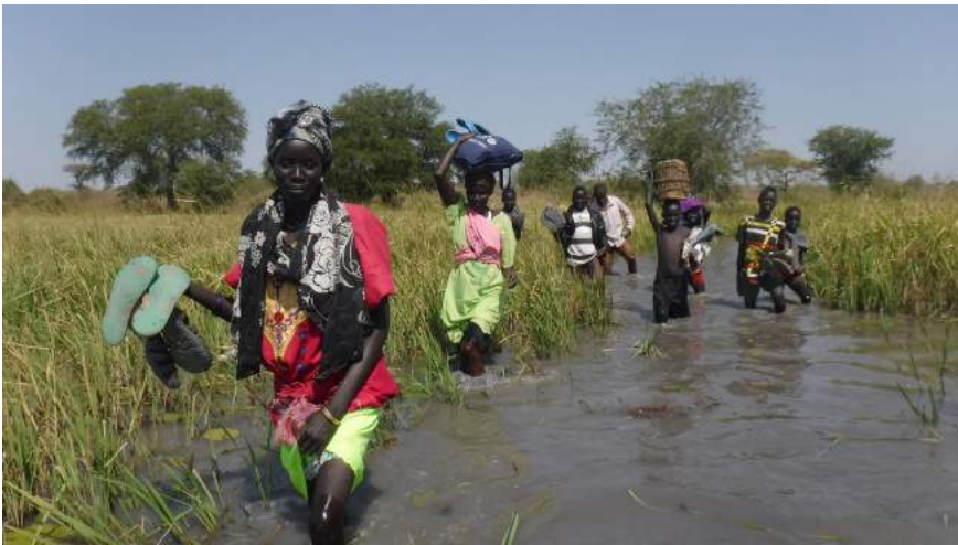
Parish youth walking from New Fangak to Lele. We went to visit the chapel for a few days to pray and give the sacrament of confirmation. It is custom that a big group of people walks with the missionary. They carry his bag and sometimes a flag or a drum to accompany singing. This demonstrates the unity of the faithful.

In South Sudan, there is no secular society. Therefore, international peace