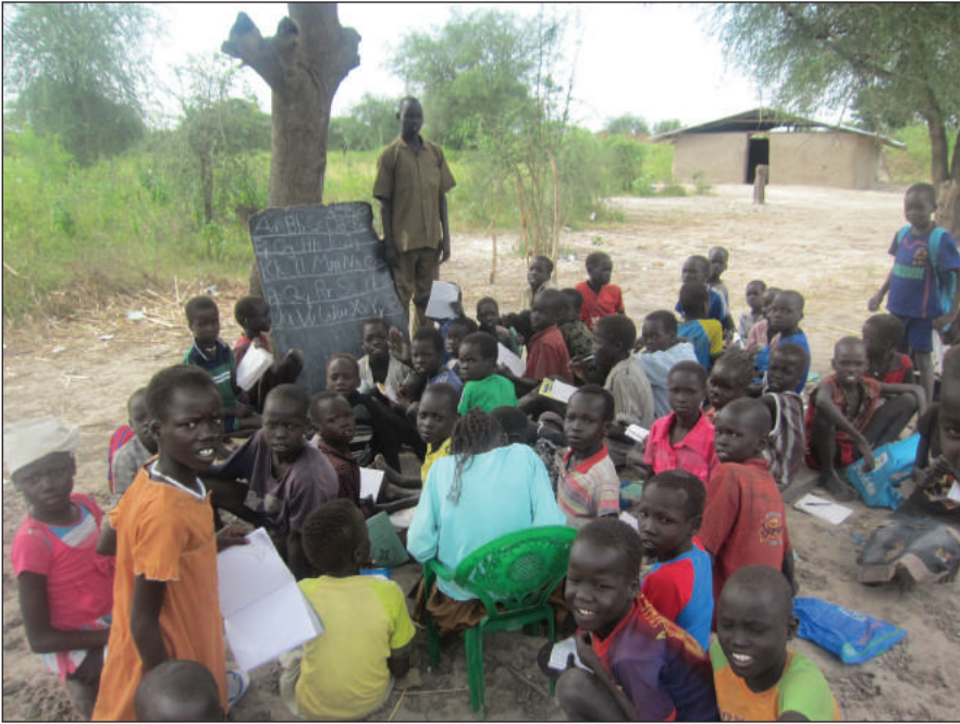
Comboni primary school in Leerpiny.

However, I would argue that this is unlikely to be the case. The main elements of Nuer (and other pastoralist cultures) are very old and I was struck by the similarities between Nuer culture and those described in the Bible. A comparison with murder and manslaughter among the Israelites, who were themselves shepherds, is a good introduction for Western readers (e.g. 1 Chr 7:21; Gen 34). The polygamous patriarchal family and value system is very similar: among other things, revenge killings. These are based on an equilibrium recognized by all, which demands that a human life must be taken in order to atone for the death of a victim. Unlike the Old Testament (Gen 9:6), however, it is not important to find the murderer. It is enough to assassinate a close male relative as ‘compensation’, because the individual person represents the clan.