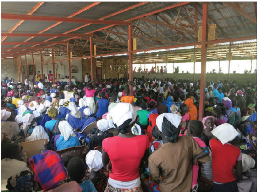
Sunday Mass in Old Fangak.