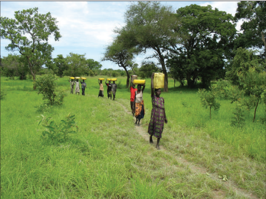
Women carrying water from a borehole.